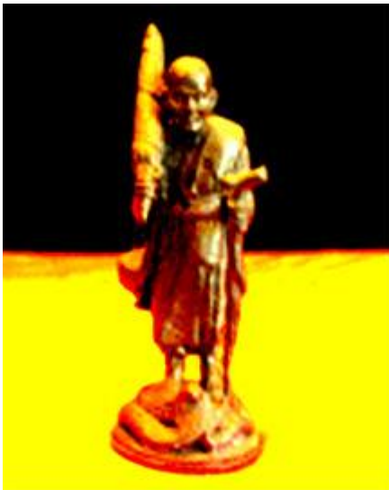
Sivali Thera As depicted in Myanmar

Because of this simple gift at the time of the Vipassi Buddha , the villager was reborn numerous times in celestial planes and he became the prince who inherited the throne of Benares. In his final lifetime, he became the Elder Sivali and attained Arahatsip as a disciple of the present Buddha. Even after that, his gift of the honeycomb continued to bear fruit. To honor the one who had made the sweet gift aeons before, the gods provided lodging and food for the Buddha and five hundred of his monks, including Sivali, when for several days they had been walking along a deserted road.